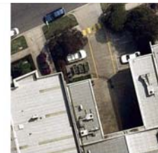
Car parks used and 2 turned into a pop-up farm