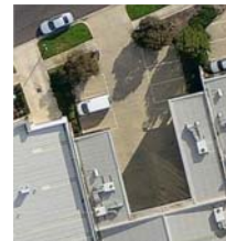
Car parks not always used