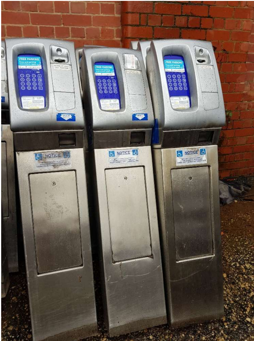
Duncan Solutions: Reino RMV3 Pay by Bay Meters x 32