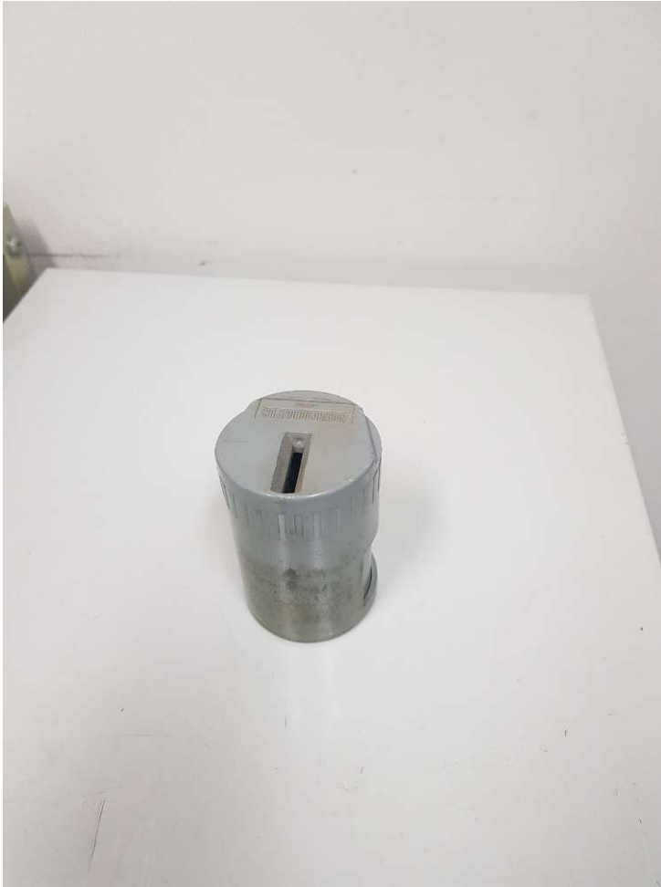
Duncan Solutions: Single head Meter spare canister x 40