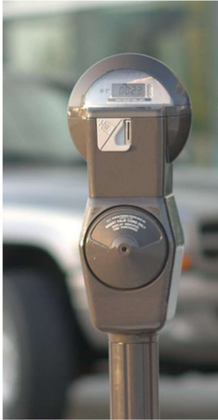
Duncan Solutions: Single head Eagle Meter with canister x 40