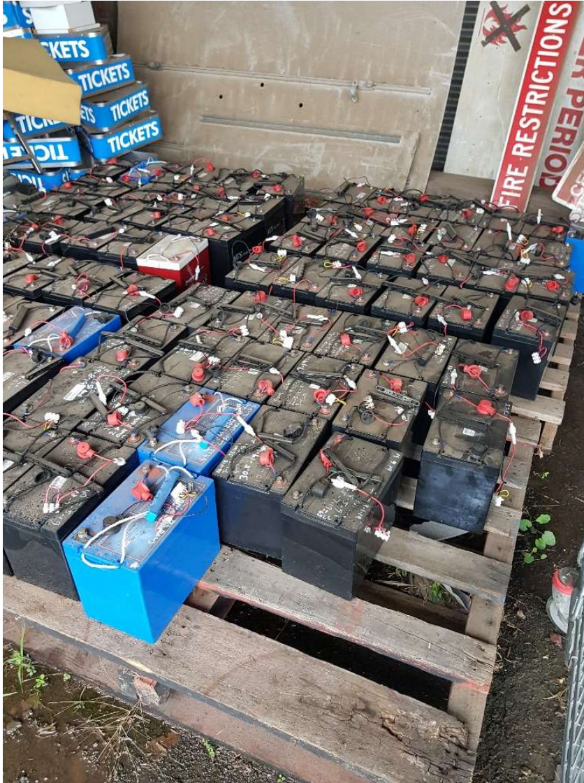
Deep Cycle 12v Batteries to run CDS Worldwide Pay & Display Machines x 96