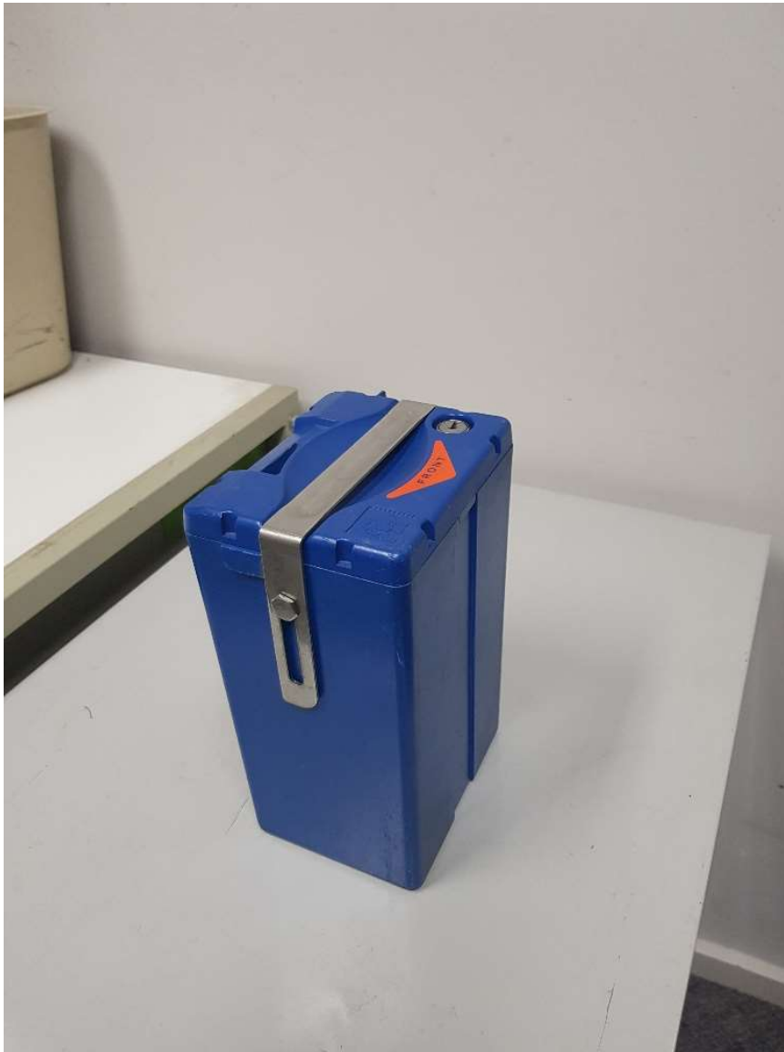
Duncan Solutions: Reino RSV2 Pay by Bay Meters Spare Cash Boxes x 50