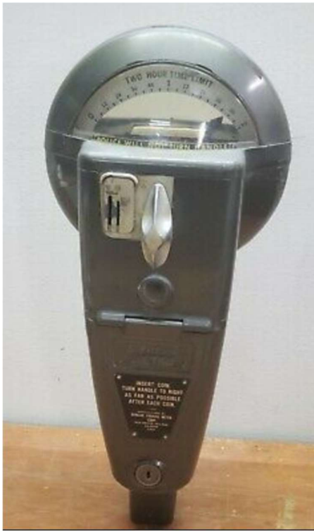
Duncan Solutions: Single head Eagle Meter x 90