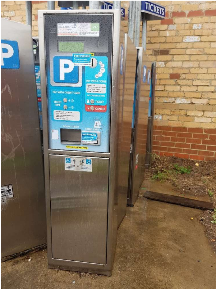
CDS Worldwide: Spark 5 Pay & Display Machines x 11