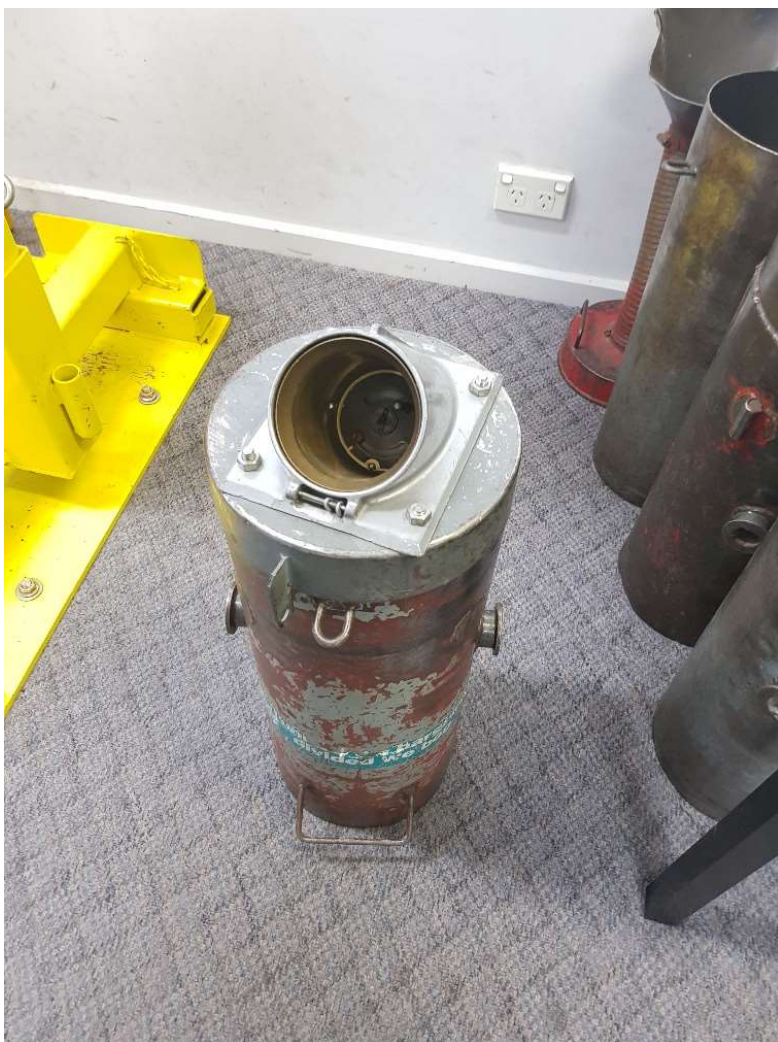
Duncan Solutions: Single head Meter spare canister opener x 1