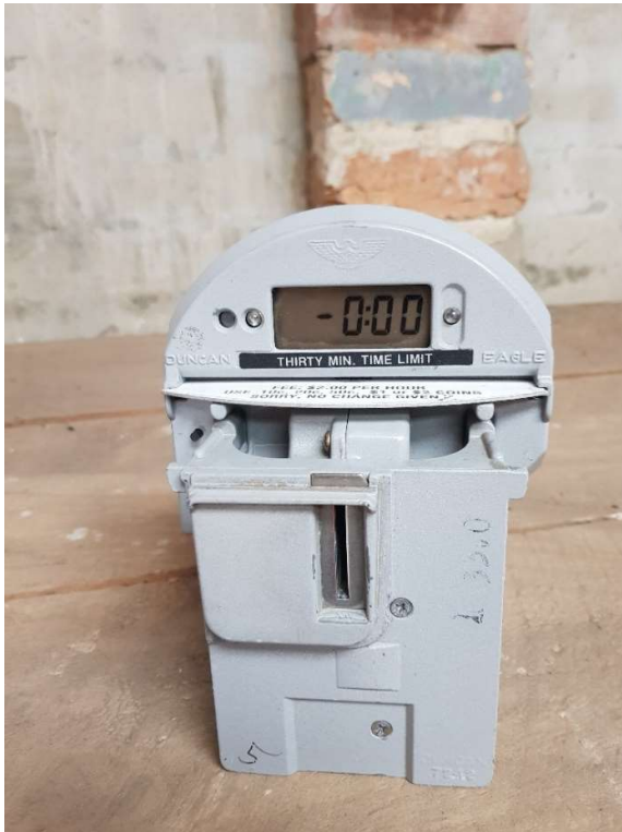
Duncan Solutions: Single head Eagle Meter spare inserts x 70