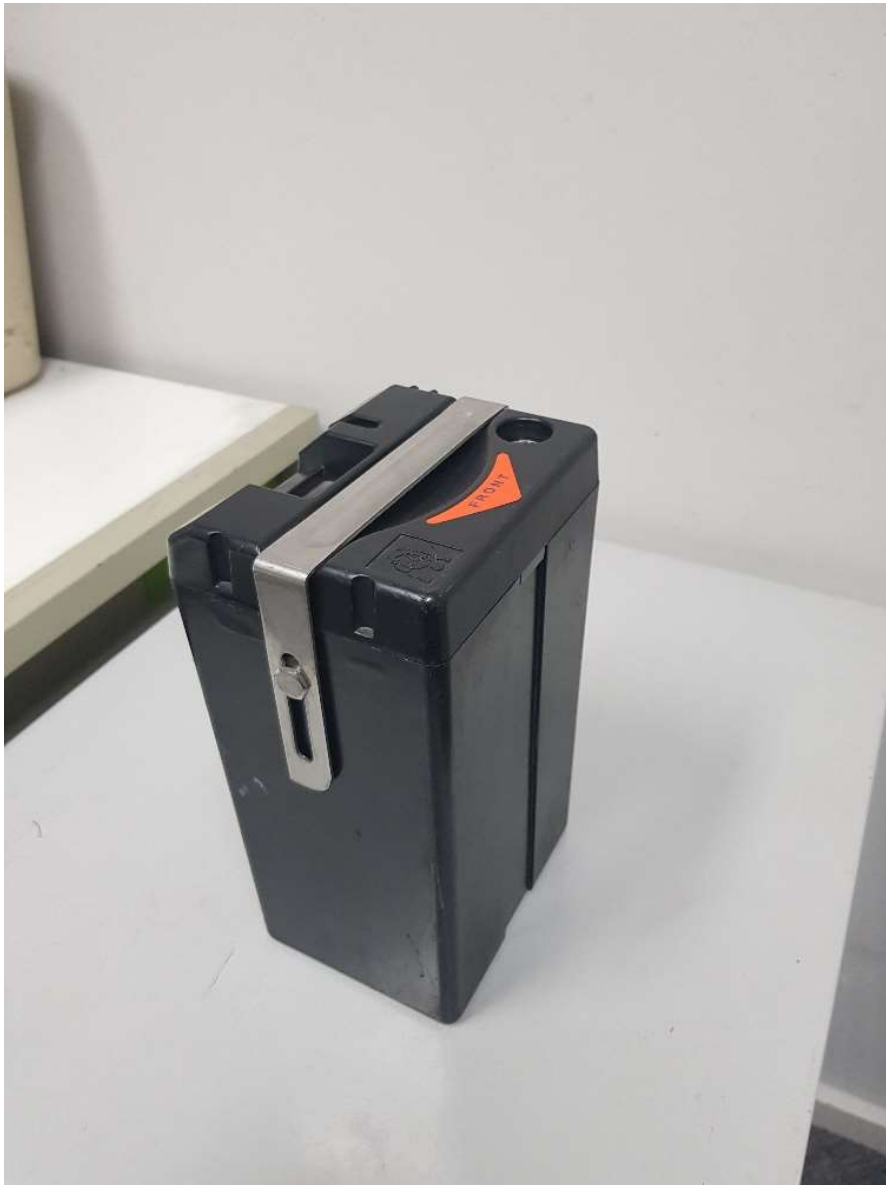
Duncan Solutions: Reino RMV3 Pay by Bay Meters Spare Cash Boxes x 60