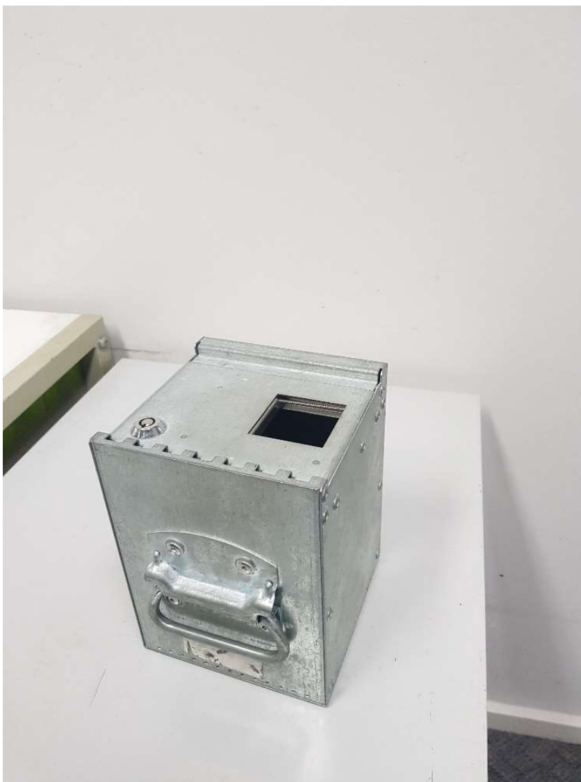
CDS Worldwide: Pay & Display Machines Spare Cash Boxes x 70